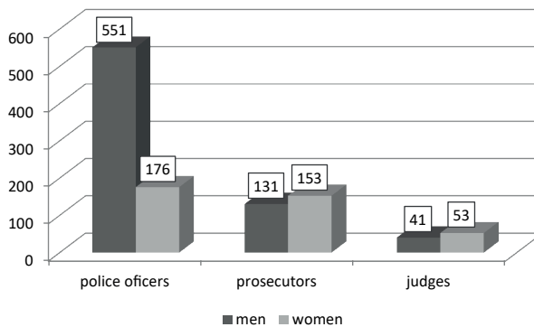
Figure 2. Distribution of professionals by sex

The gender and age group distribution of the respondents is noteworthy: although the study is not representative of any of the professions, the high number of those working for more than 15 years and of female prosecutors and judges was typical. Two thirds of the respondents were men (n=723; 65.4%) and one third were women (n=382; 34.5%). As Figure 2 shows, there were more women than men among the prosecutor and judge respondents.